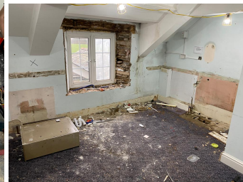
Building work has now started on the first floor: Class 3, the library, and the staffroom. The project is nearing the end and hopefully a couple of months to go.

It's been a great week here at Werrington. Children have been very excited about their learning and working really hard - well done.