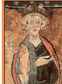
King Edward the Confessor