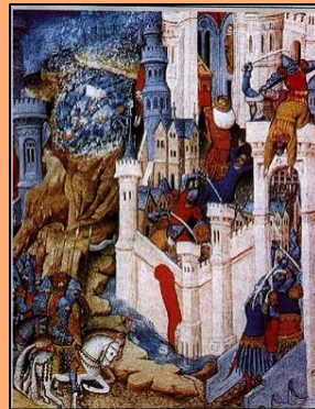
Sack of Rome 410