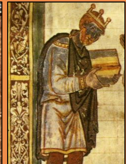
King Athelstan of England