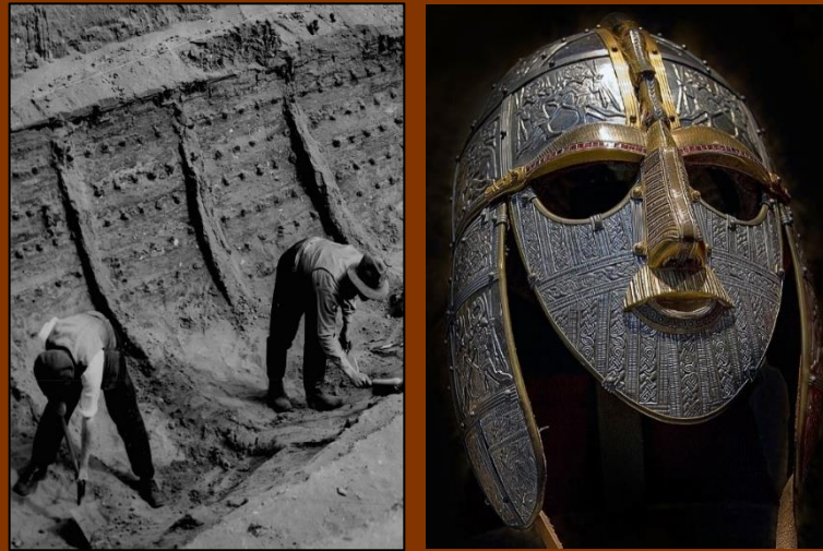
Sutton Hoo Ship Burial, Suffolk