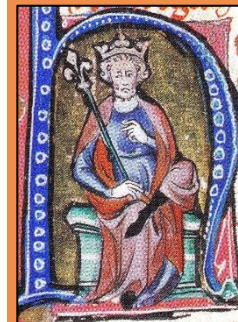
King Cnut of Denmark and England