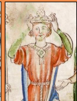
Harold Godwinson (King Harold II)