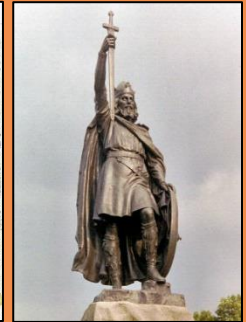
King Alfred the Great