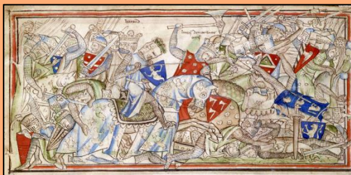
Battle of Stamford Bridge 1066