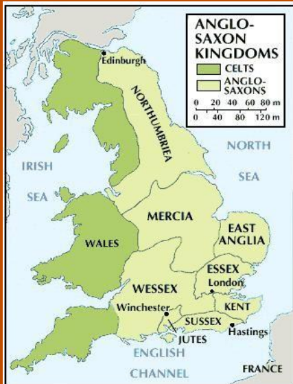
Anglo Saxon Kingdoms AD 566